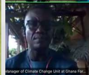
Manager of Climate Change Unit at Ghana For...